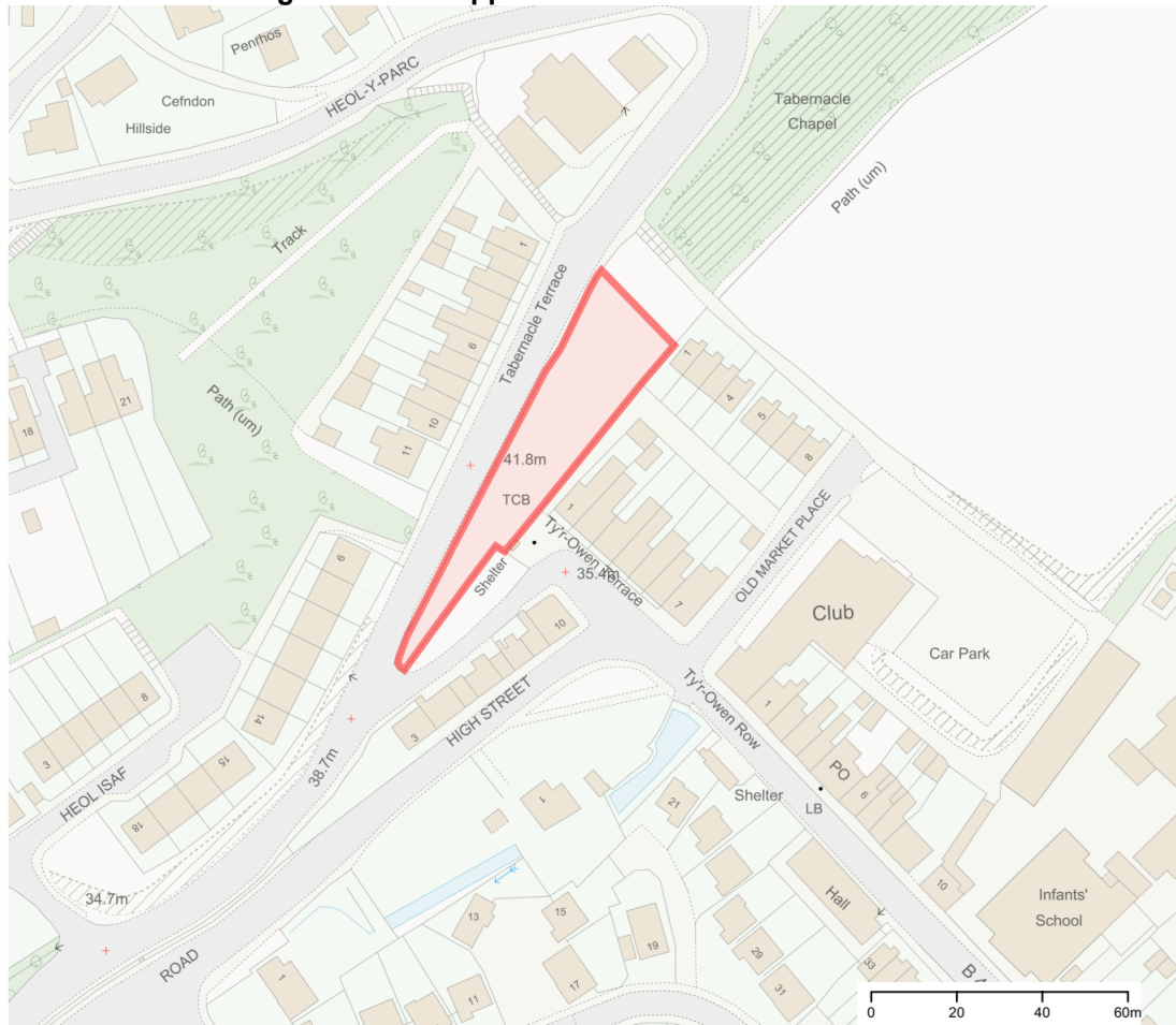
Plan 1: Plan showing location of application site

The site is triangular in shape with an area of 0.18 hectares, the site is bounded to the North West by Tabernacle Terrace (front) and to the rear is Ty'r Owen Terrace and Old Market place to the rear. The northern boundary of the site does not extend up to the steps and footpath which leads down from Tabernacle Terrace towards the school. The 13m strip of land between the site and the steps is unregistered land.